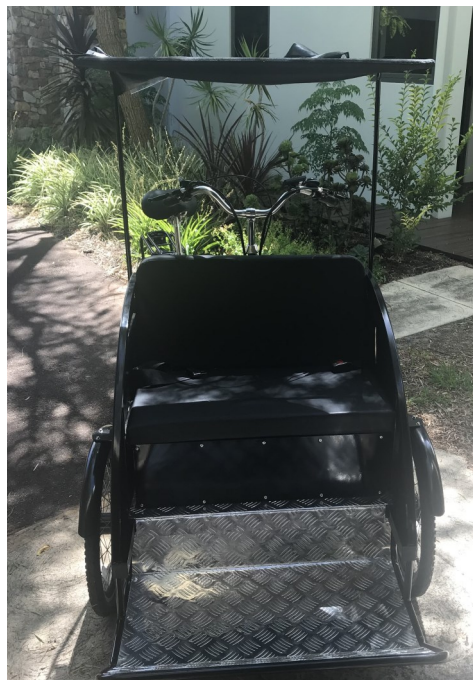
One of the tricycles